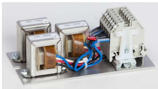
Transig PN 9701, Remote CT Isolation Unit Component Layout